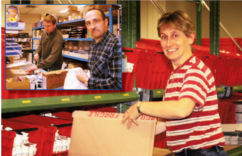
Our Warehouse In Action

THE REGULAR NEWSLETTER OF THE DR. RATH HEALTH ALLIANCE