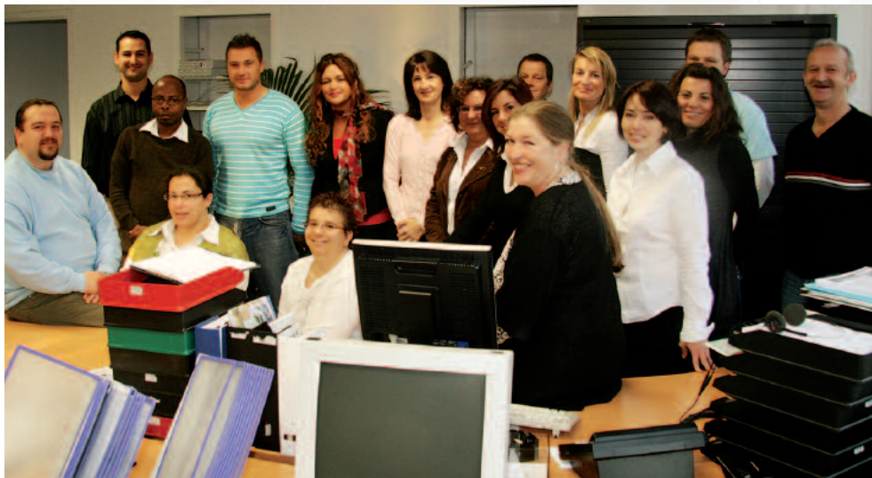
Our Service Centre Team

A number of members have asked about how best to spread the word of the benefits of Cellular Medicine and Dr. Rath products and our response is normally prefaced by "talk from your heart." To introduce someone to the products, one has to believe in them. This can only be achieved by using the vitamins and essential nutrients yourself and knowing the benefit that you have felt in your health and life and wanting to share that benefit with others.